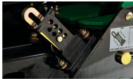
Aeration Depth Gauge provides precise aeration depth control in varying soil conditions, with a range of 2" up to 5" in half inch increments.