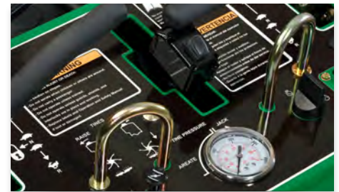
Tine lift switch to raise and lower tines conveniently located near control lever.