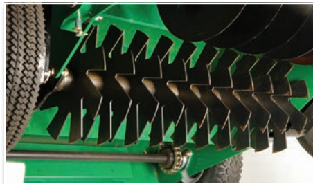
Durable cutting blades can be adjusted down to a depth of 1/2".