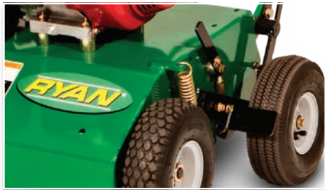
Self-propelled unit makes for easy operation and consistent ground speed.

Specifications subject to change without notice.