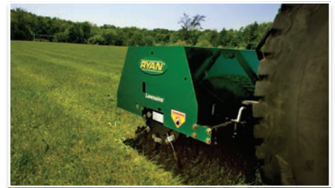
Reliable three-point hitch allows simple connection and is compatible with a wide variety of tractor models.