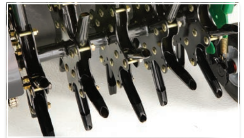
Standard 3/4", hardened alloy steel coring tines stand up to the daily rigors of even the most difficult jobs.