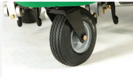
A unique front caster wheel allows the machine to maneuver with near zero-turn capability.

Specifications subject to change without notice.